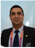
Para Taekwondo Committee Vice Chair & Games Chair