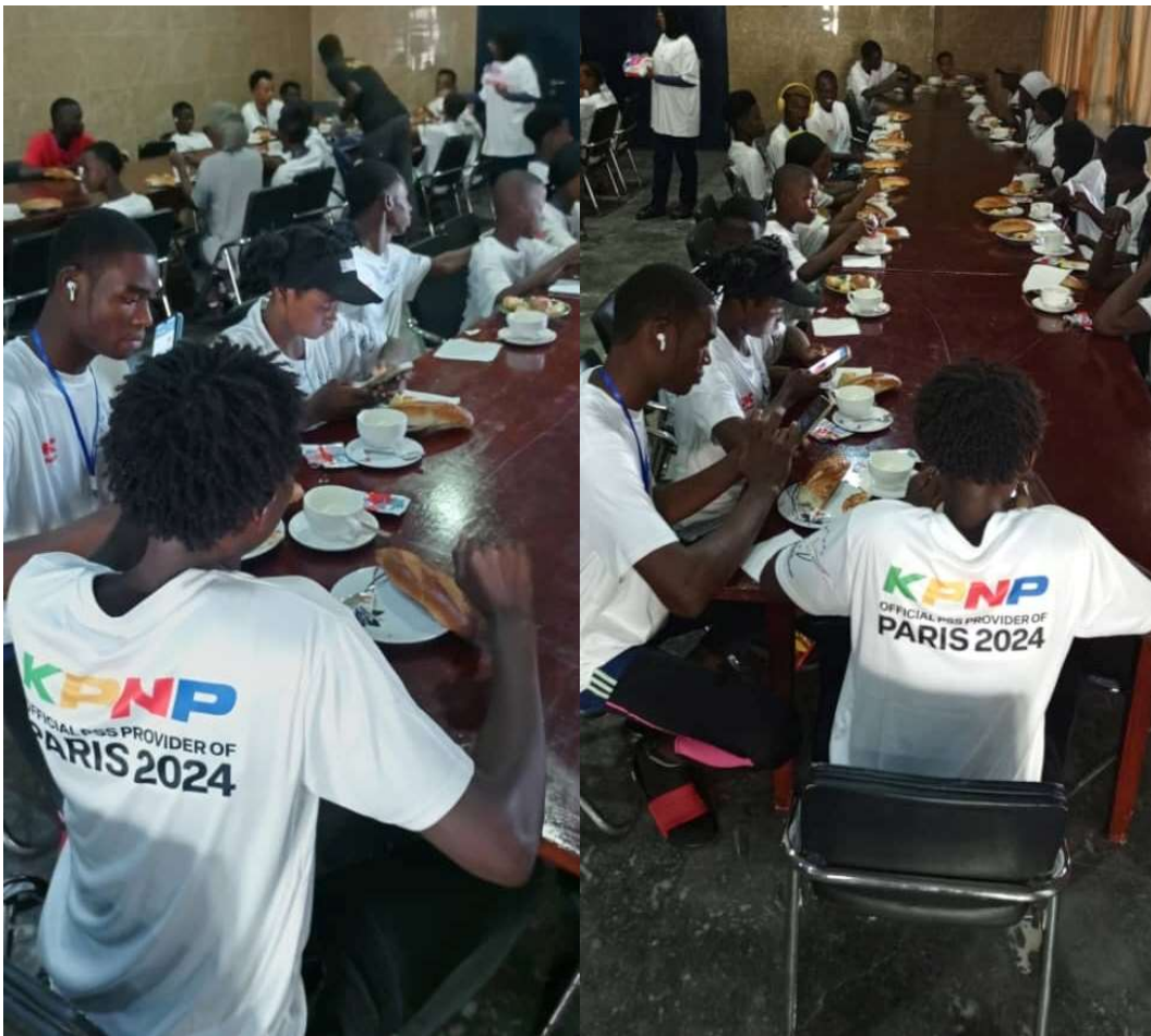
*Participants are having a meal in the dining hall at the Senegal National Arena