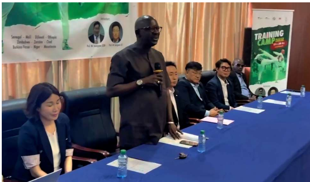
*WT coaching staff received a warm welcome from the Secretary General of the Senegal NOC

This valuable experience provided administrators with a deep understanding of event management complexities. The skills and knowledge acquired will serve as a solid foundation for preparing and executing larger-scale events in the future. This experience is expected to have a significant impact, enhancing event hosting standards across Africa and promoting greater opportunities for international events on the continent.