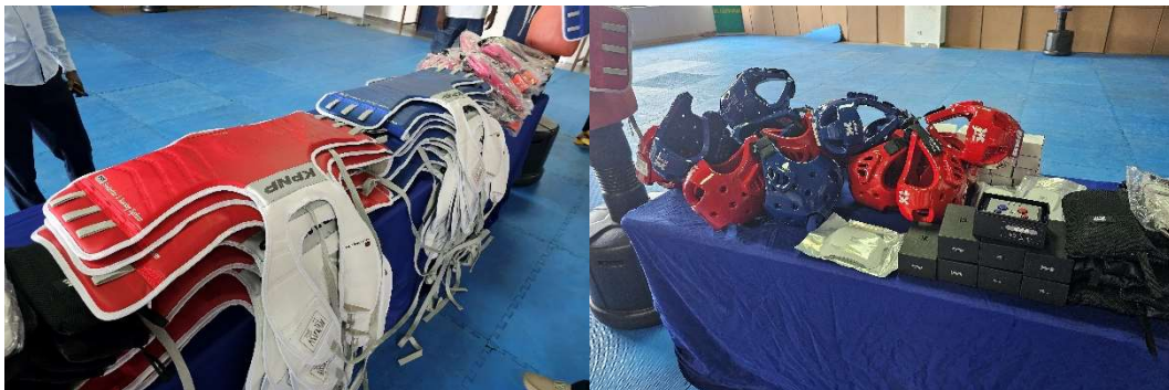
*Supported Protectors and Scoring System (PSS)