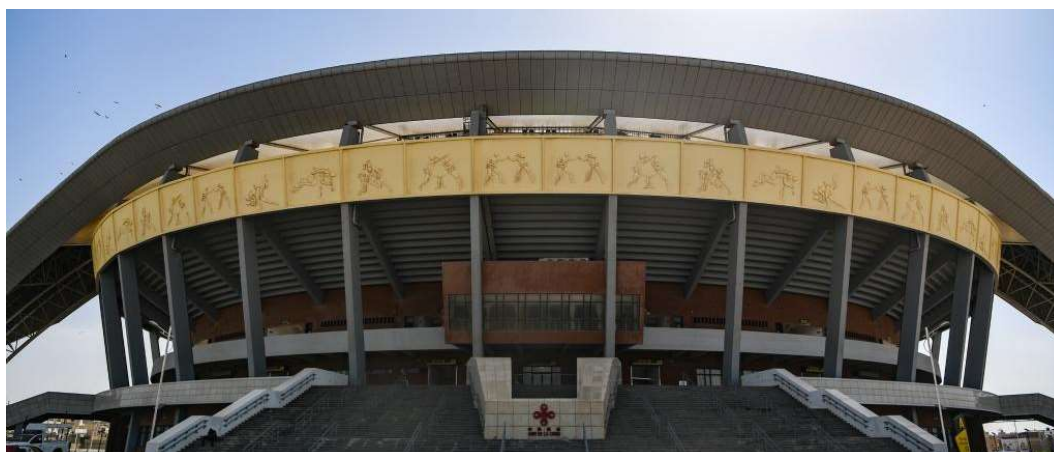
*Senegal National Arena (Arène Nationale du Sénégal)