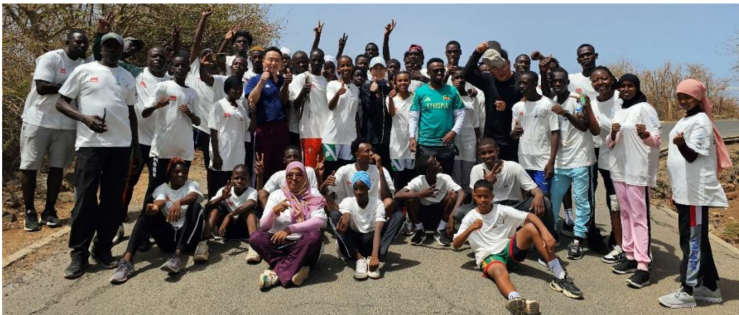
*Participants after the outdoor morning training session in the mountain