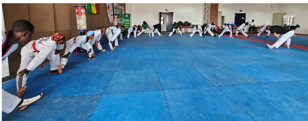
*Taekwondo National Team Training Room (Training Venue)