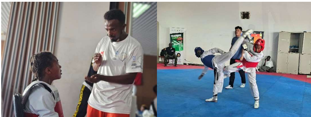
*A coach is advising his athlete (Left) / Participants are applying the techniques they have learned (Right)

Overall, the simulation matches were a highlight of the camp, offering both coaches and athletes a platform to put their training into practice and gain valuable insights for further improvement.