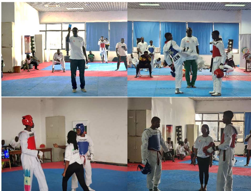
* Local referees are showcasing their skills during the PSS simulation training sessions at the camp.

Through these rigorous training exercises, referees improved their technical proficiency and built confidence in handling live competition pressures. This comprehensive training ensures Senegal's referees are well-prepared for both domestic and international events, raising the overall standard of Taekwondo officiating in the region. This initiative is expected to have a lasting impact, contributing to the sustained growth and professionalism of Taekwondo in Senegal and beyond.