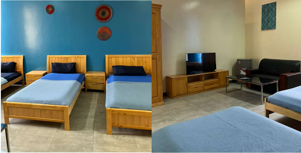
*Rooms for teams during the Olympic Solidarity Camp