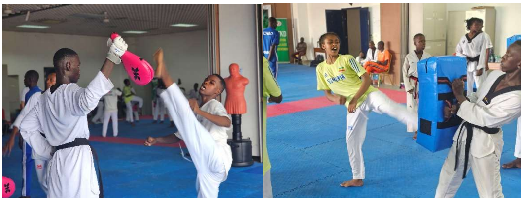
*Participants are mastering various kicks using the supported training equipment