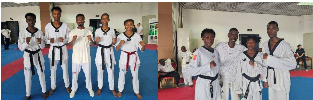
*Team Ethiopia (Left) / Team Chad (Right)