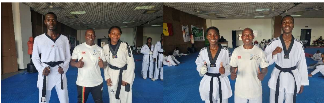
*Team Zambia (Left) / Team Zimbabwe (Right)