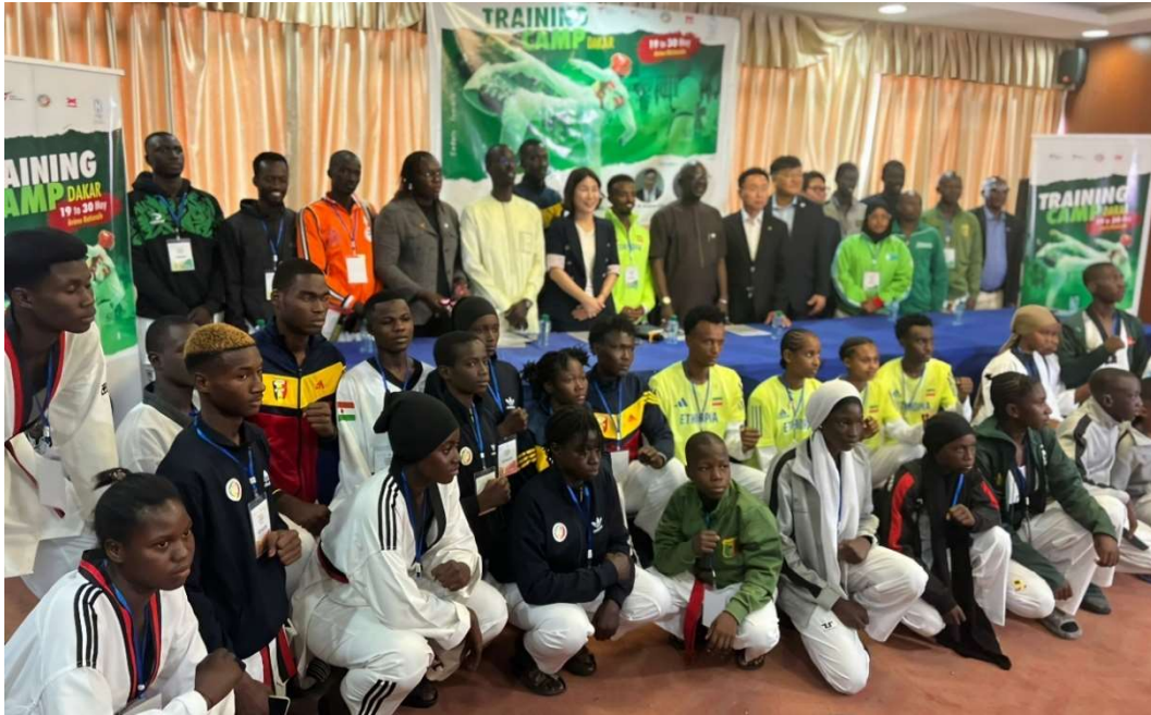
*Group photo of participants at the Opening Ceremony of the WT Olympic Solidarity Camp 2024 for Youth

A total of 32 youth athletes and 10 coaches from 9 different countries participated in the event. Additionally, 3 local officials served as PSS operators, and 4 referees were also present. Initially, invitations were extended to 10 countries; however, one country could not participate due to passport issuance issues.