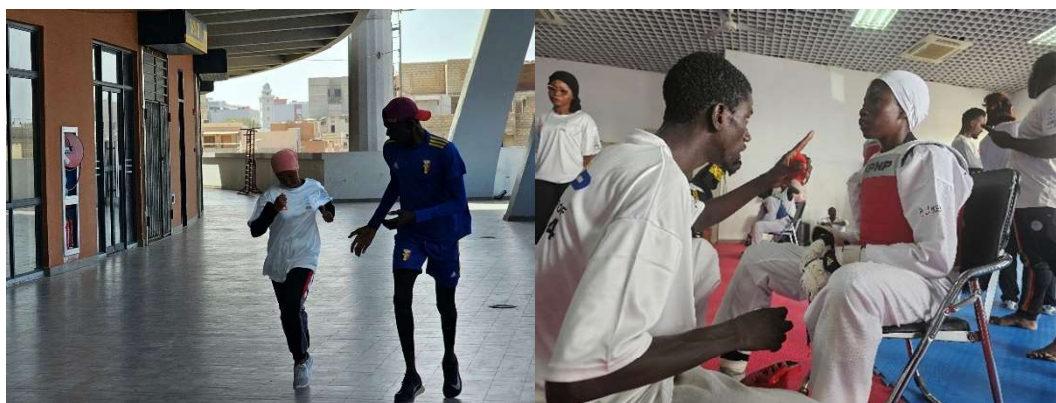
*Coaches are actively encouraging and guiding athletes during training sessions.

Overall, the camp provided a comprehensive educational experience, equipping coaches with the tools to enhance their effectiveness. By integrating scientifically-based training methods and tactical insights, coaches are now better prepared to contribute to their athletes' success, ultimately raising the standard of Taekwondo coaching and performance in their respective countries.