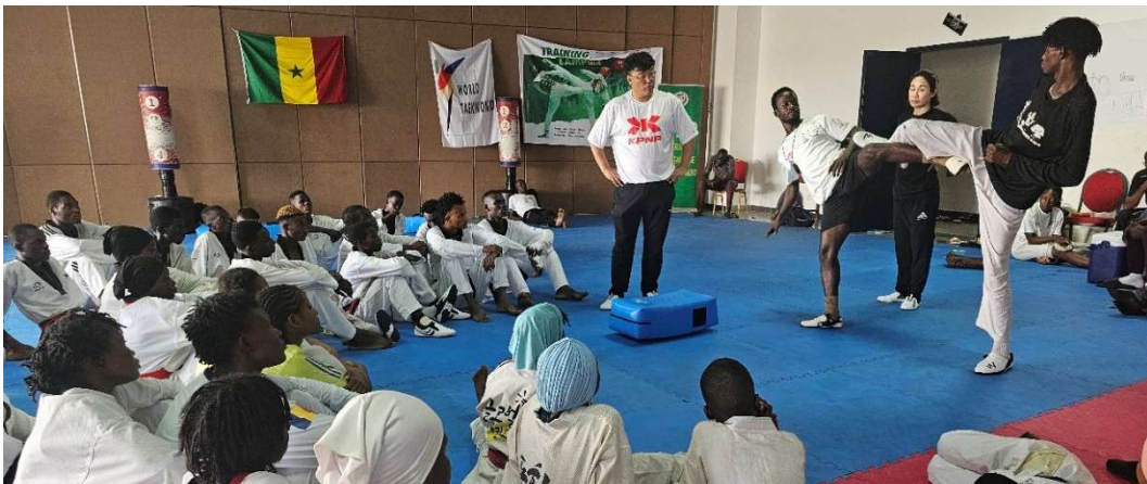
*WT Coach is providing guidance and demonstrations to participants

The structured approach of these sessions allowed athletes to develop a deeper comprehension of the tactical aspects of Taekwondo, improving their ability to execute precise and powerful techniques within the PSS framework. The training emphasized both individual skill development and the integration of these skills into cohesive tactical strategies, preparing participants for high-level competition. Through repetitive practice and detailed feedback from experienced coaches, participants were able to significantly enhance their proficiency and confidence in using the electronic scoring system.