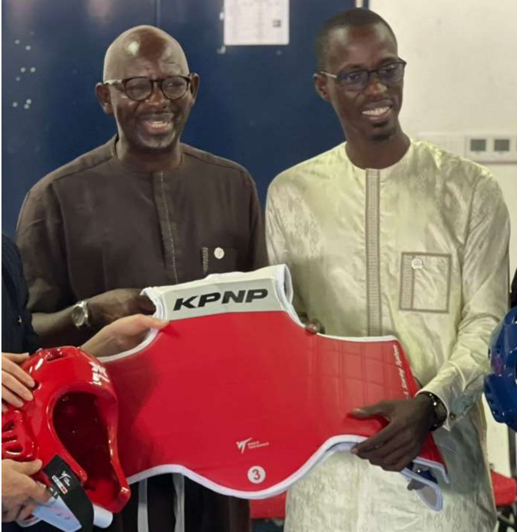
*Training Equipment (PSS sets etc.) with SEN NOC SG and SEN MNA President

PSS sets for training, electronic socks, Taekwondo kick pads, and T-shirts were provided for the WT Olympic Solidarity Camp 2024 for Youth. After being used for this training camp, these equipment items will remain in Senegal as a legacy. They are expected to significantly aid in the organization of future events and the promotion of Taekwondo locally.