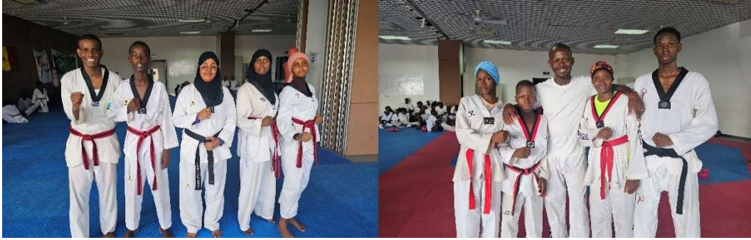
*Team Djibouti (Left) / Team Mali (Right)