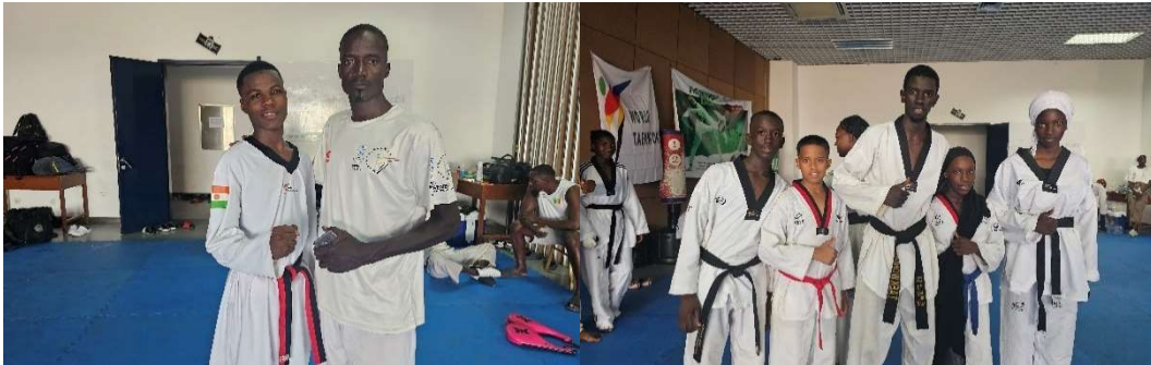
*Team Niger (Left) / Team Mauritania (Right)