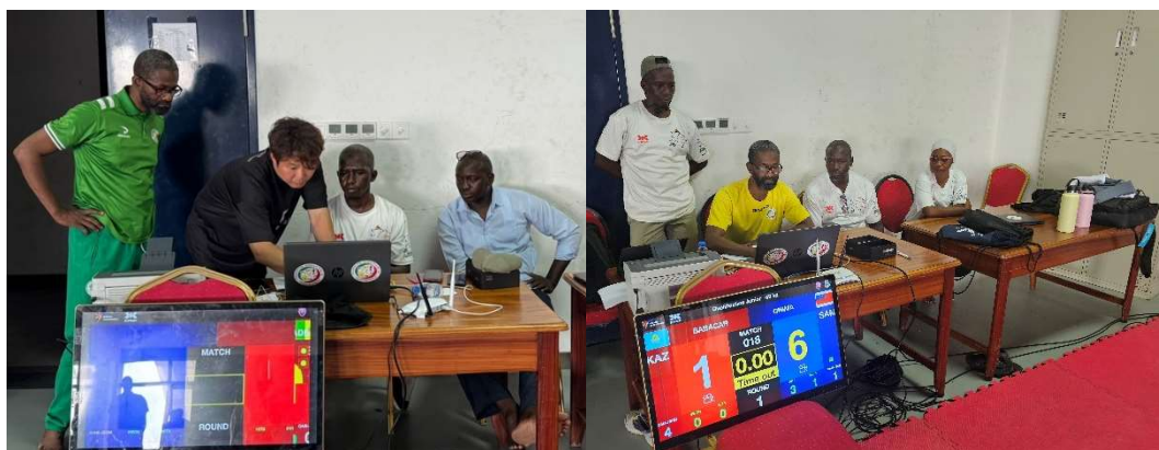
*Local officials took on roles as PSS operators, conducting mock operations

The long-term benefits of this initiative are significant. By developing internal expertise, WT can ensure more consistent and reliable event operations, reduce costs associated with external hiring, and foster a culture of continuous learning and improvement. This initiative not only strengthens the technical capabilities of current operators but also builds a robust foundation for future generations, ensuring the sustained growth and development of Taekwondo.