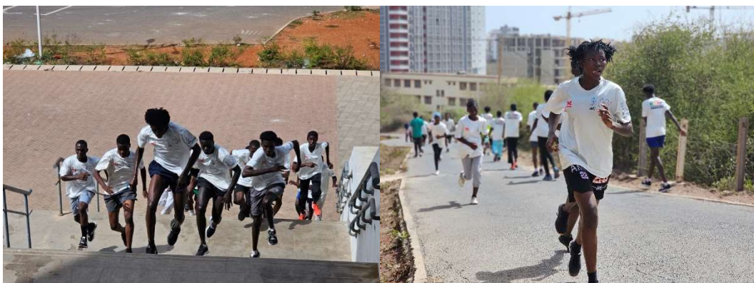
*Participants during the morning training session (Left: Stair Climbing, Right: Mountain Training)

The structured approach of the morning training sessions not only improved the athletes' physical capabilities but also instilled a sense of discipline and resilience. These qualities are essential for their development as well-rounded Taekwondo practitioners capable of handling the physical and mental challenges of the sport.